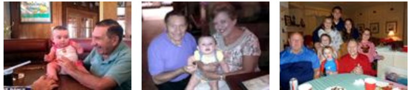
St. Johns Family Funeral Home - December 11, 2020 at 09:33 AM

“ 3 files added to the album LifeTributes