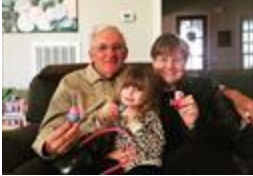
beckyrossetti - June 09, 2023 at 07:12 AM